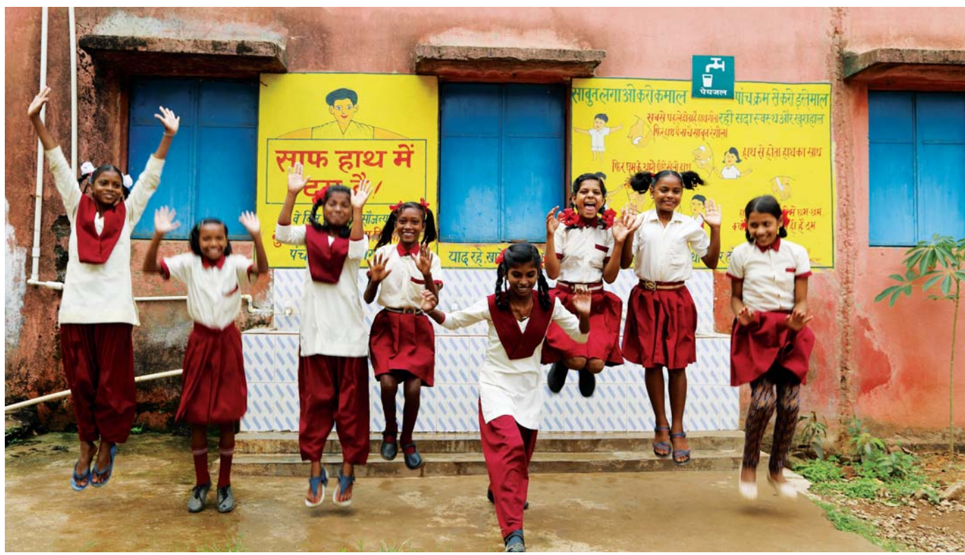
100 Days Campaign to Provide Piped Water Supply in Anganwadi Centres, Ashramshalas and Schools