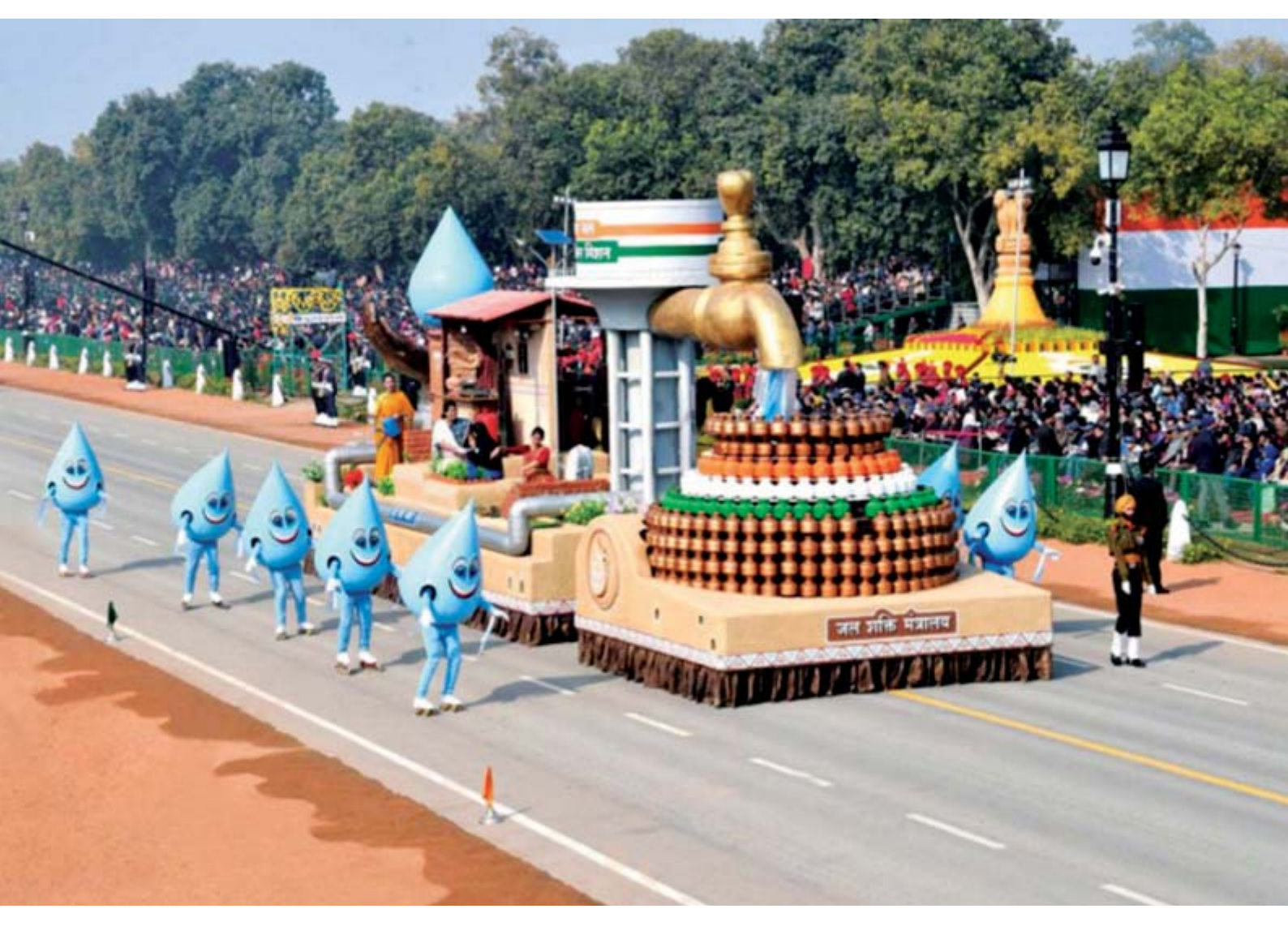
Best Tableaux, Republic Day Parade 2020 on Jal Jeevan Mission

Government of India Ministry of Jal Shakti Department of Drinking Water and Sanitation National Jal Jeevan Mission New Delhi